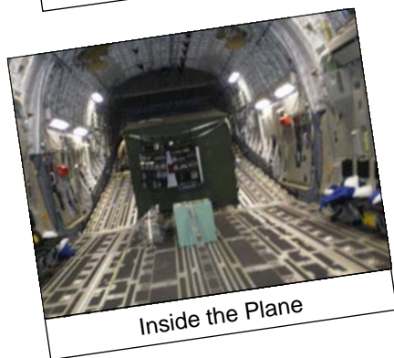
Inside the Plane