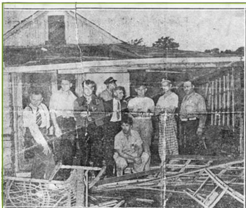
A Doyle Fire Co. member points to the wall that was blown out by the freakish lightning strike.

out of the cottage, knocking down most of the men. They all survived but 9 were injured.