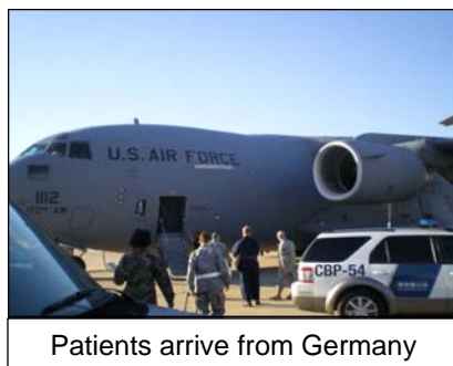
Patients arrive from Germany