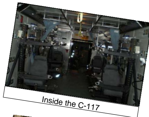
Inside the C-117